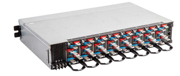
Artesyn iTS™ transfer switch enables industry-leading power and control for indoor farming